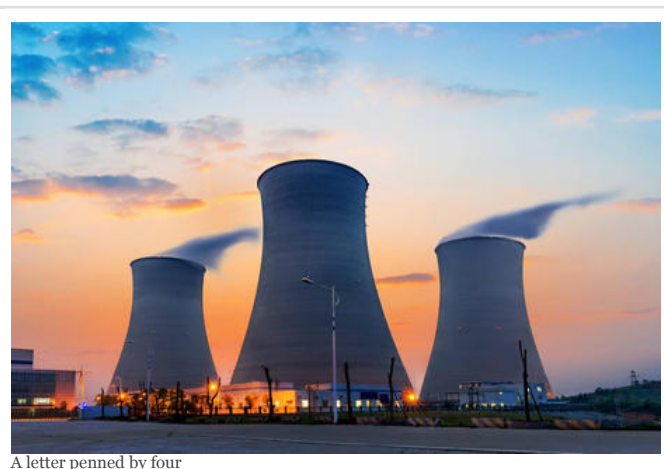
A letter penned by four climate scientists urges the environmental community to embrace nuclear power as a way to reduce global warming and climate change. The missive stirs up debate in Utah, where a nuclear power plant is planned.